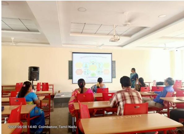
FACULTY DEVELOPMENT PROGRAME