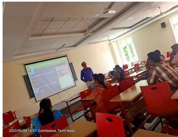
FACULTY DEVELOPMENT PROGRAME